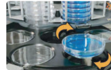
Plate Pouring System Option

Built-in Peltier cooling effect Reduces condensation and solidification time