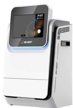
「Magic」 Mini Chemi Imager