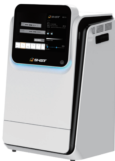
「Magic」 Multi functional Imager