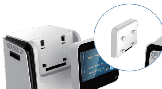
Removable industrial computer