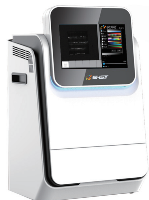
「Magic」 Gel Doc System