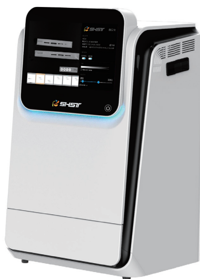
「Magic」 Multi functional Imager