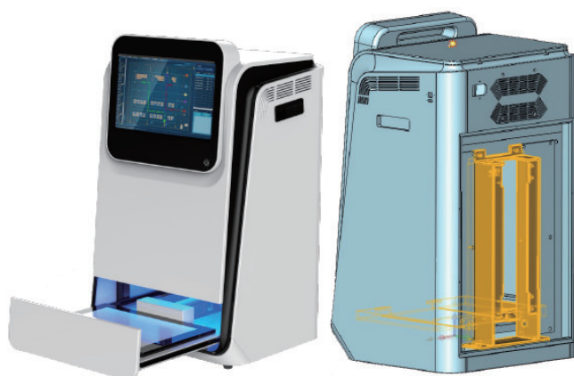
Electronic lifting platform and accurate auto focus